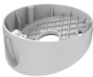
Inclined Ceiling Mount DS-1259ZJ