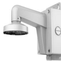
Wall Mount + Junction Box DS-1272ZJ-110B