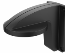
Wall Mount DS-1258ZJ(Black)