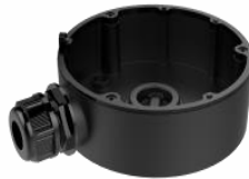
Junction Box DS-1280ZJ-DM18(Black)