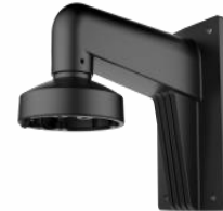
Wall Mount DS-1272ZJ-110(Black)