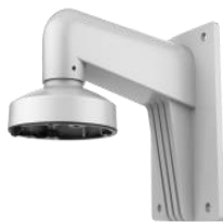
Wall Mount DS-1272ZJ-110