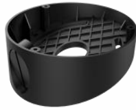
Inclined Ceiling Mount DS-1259ZJ(Black)