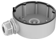
Junction Box DS-1280ZJ-DM18