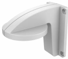
Wall Mount DS-1258ZJ